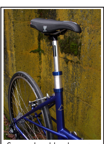
Super adjustable telescoping seat tube option.

Parts specifications subject to change depending on availability