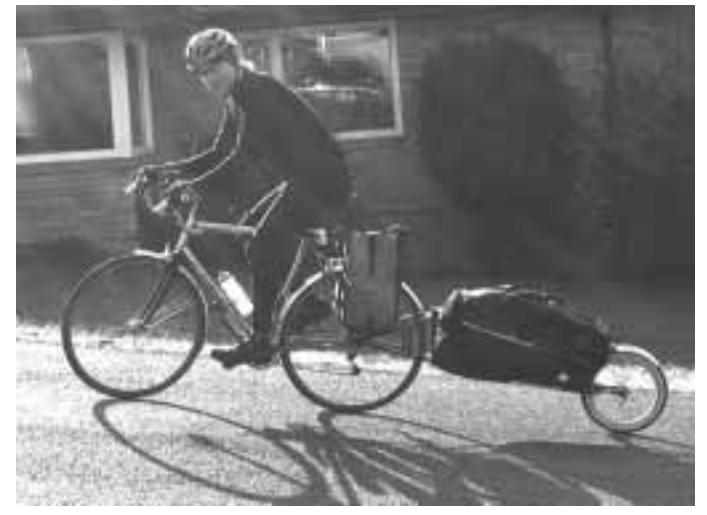
Me, commuting on a sunny winter day last November. Notice I'm smiling even though I'm pulling over 100 pounds up the hill. That's what comfort can do for you;-)

I guess the moral of the story is: Treat your commuter as your prized possession, and it'll keep you wanting to ride all year. There's no reason to think of it as a throw away bike.